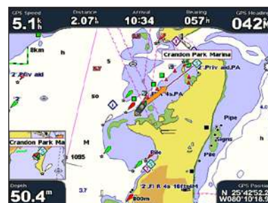
Go to Destination