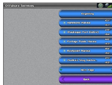
List of Marine Service Items