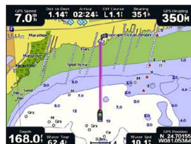
Go to Destination